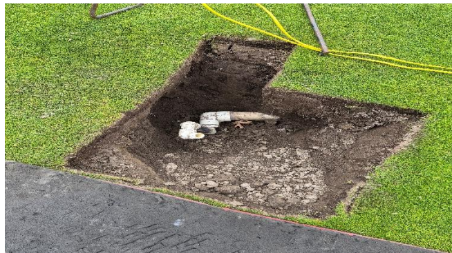
Irrigation repair on hole #18