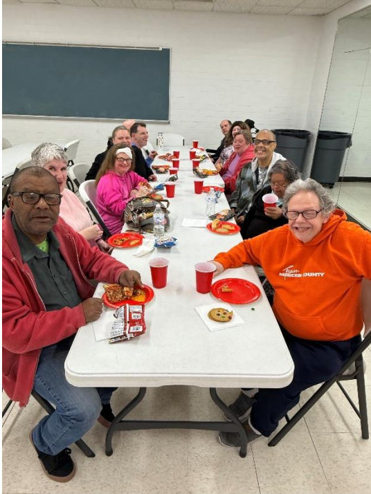
ADAPT Game Night Special Olympic Spring Games