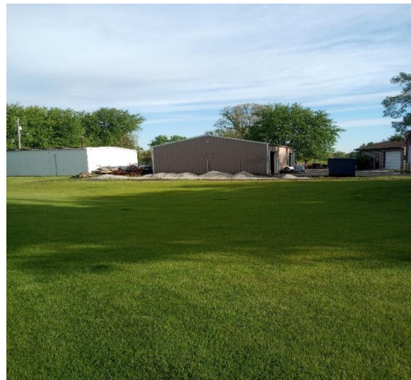
Storm damage along entrance road. Ca6 rock ready to spread behind building B.