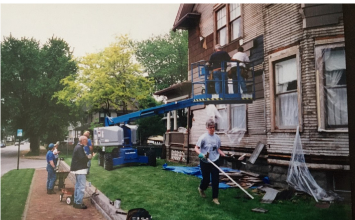
Fig. 3. Great Unveiling, South Side