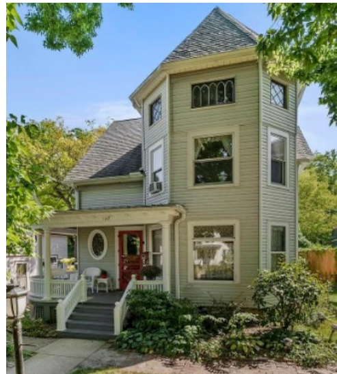
Fig. 11. Home at 1217 21st Street