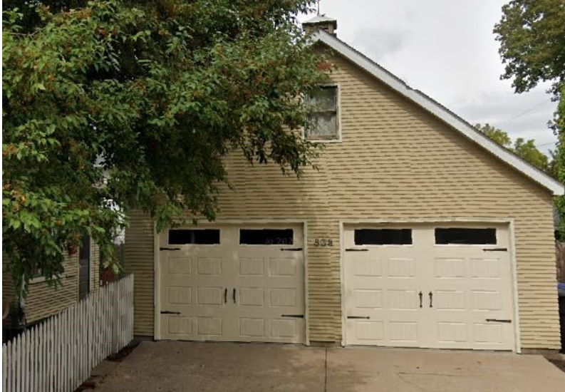
Fig. 9. Garage