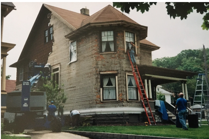
Fig. 2. Great Unveiling, NW corner

The home at 839 23rd Street is an early example of Broadway's Great Unveiling, and the photos below show some of the repairs that had to be made here. Yet, as in many cases, the overall virgin growth cedar siding was in surprisingly good condition.