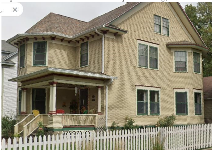
Fig. 5. SW Corner

A lower, two-story hipped addition to the roof extends part way over the enclosed back porch, which also has a hipped roof.