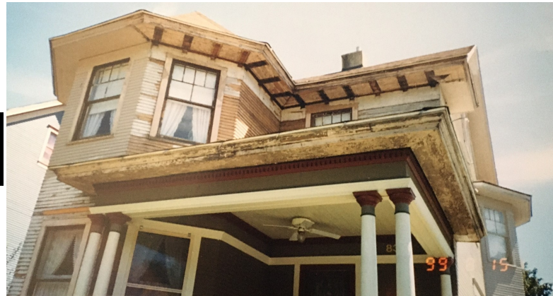
Fig. 4. Great Unveiling, West Side Showing Missing Modillions