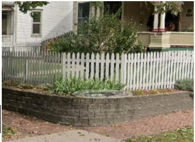
Fig. 10. Retaining Wall, Fence, & Brick Sidewalk 607 W. Edgington