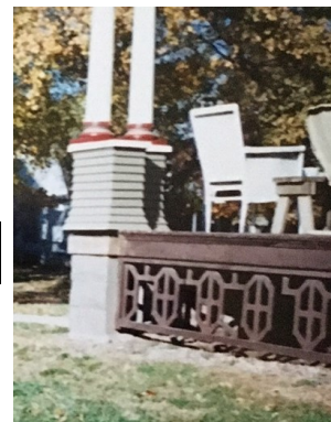
Fig 8. Original Under Porch Detail